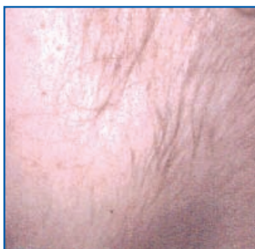
Before Hair Removal

A laser produces a beam of light that targets the pigment in the hair follicle and disables it. The treated hairs remain suspended as stubble for about a week, and then begin dropping off to leave a smooth, clean area. I find that most people can expect significant clearance after a series of treatments. Eventually, the majority of the hair follicles are exhausted and you gain freedom from the daily or weekly ritual of hair removal, a happy result. Let me help you achieve that freedom.