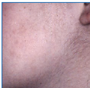
After Hair Removal